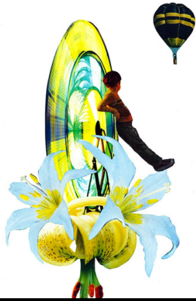
INSIDE: ENJOY THE RIDE