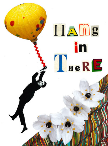
HANG IN THERE/#09 $2.50 / RRP $5