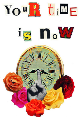
YOUR TIME IS NOW/#22 $2.50 / RRP $5