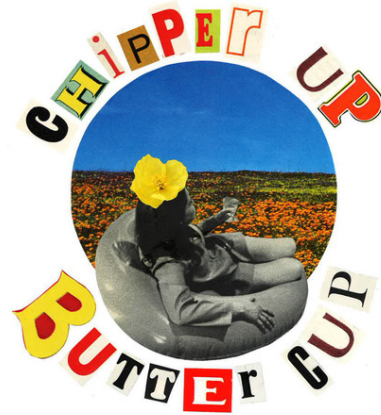
CHIPPER UP/#05 $2.50 / RRP $5