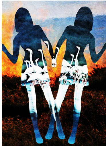
DANCE THRU FIRE/#06 $2.50 / RRP $5