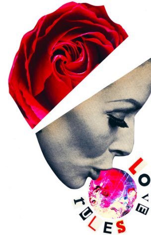
LOVE RULES/#12 $2.50 / RRP $5