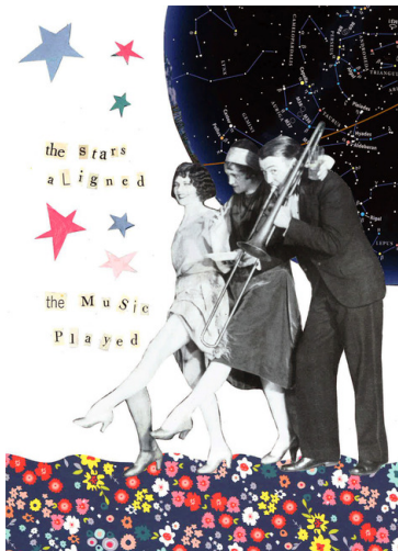
INSIDE: AND YOU WERE BORN!