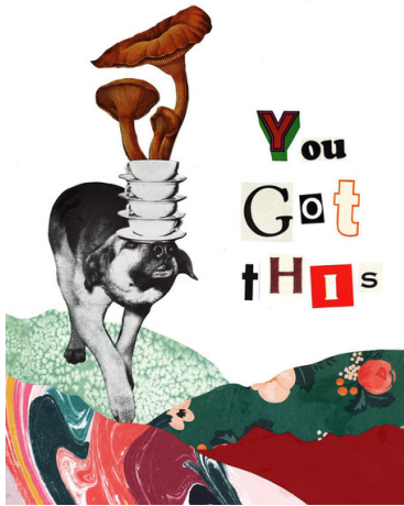
YOU GOT THIS/#21 $2.50 / RRP $5

SARA BRACKEN 2062807338 SARA@POPLOVESTUDIOS.COM