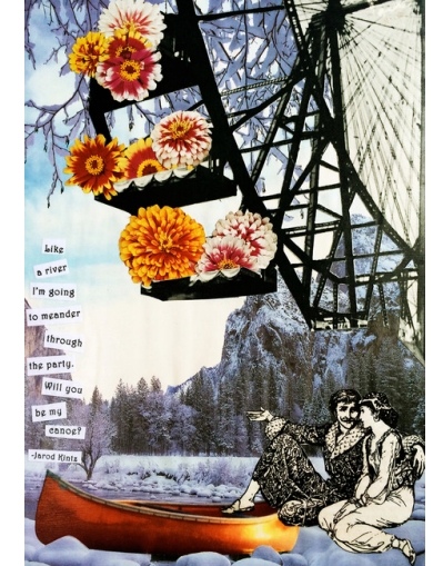
BE MY CANOE/#24 $2.50 / RRP $5