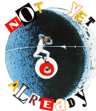
INSIDE: DANCE IN THE NOW