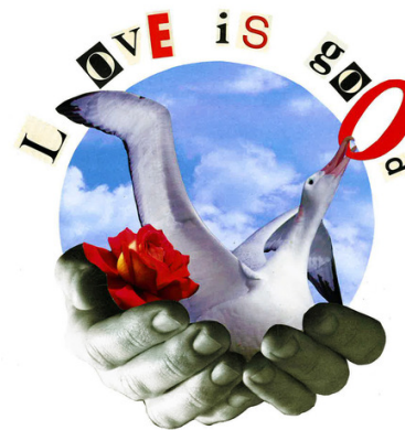
LOVE IS GOOD/#11 $2.50 / RRP $5