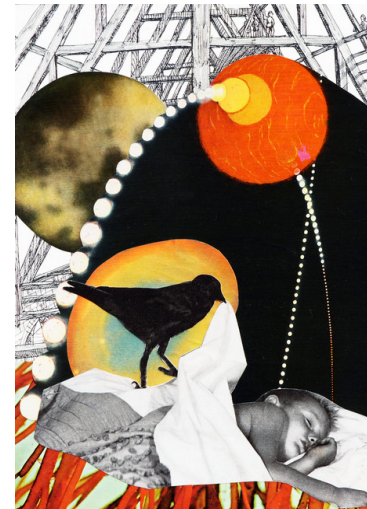
MYSTIC CHILDHOOD/#14 $2.50 / RRP $5