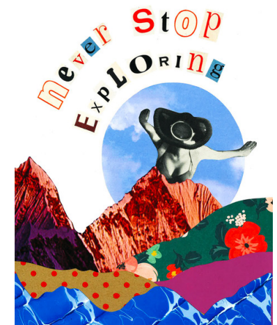
NEVER STOP/#15 $2.50 / RRP $5