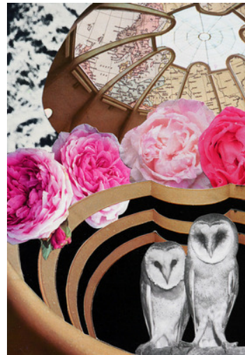
BEAUTIFUL WORLD/#23 $2.50 / RRP $5