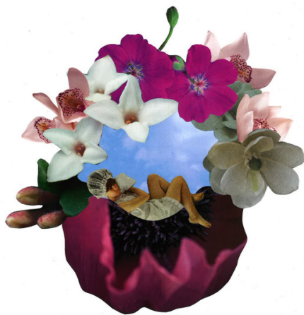
BEAUTY SLEEP/#02 $2.50 / RRP $5